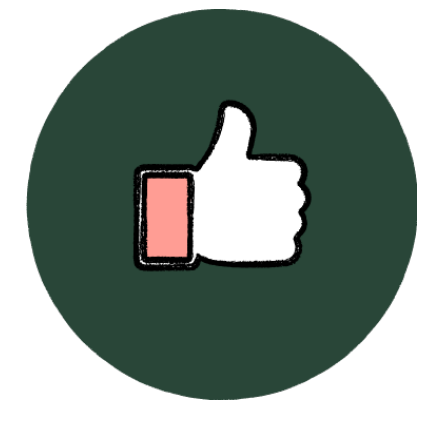
Social: facebook.com/manypetsuk Twitter: @manypets_uk Instagram: @manypets_uk